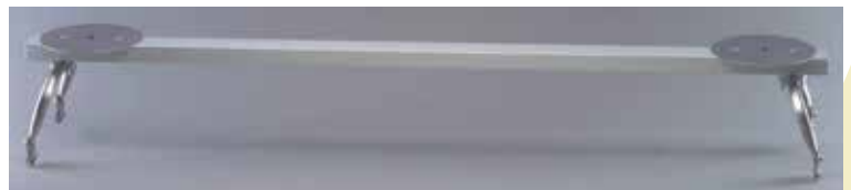
AB3, 3"x 1.5" Tubing