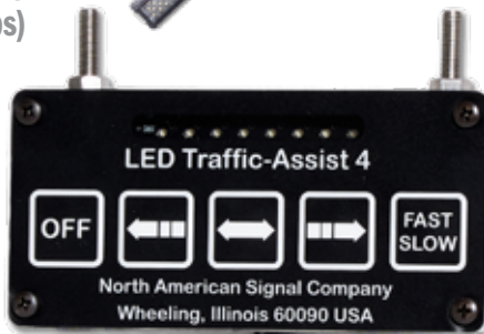
SSWTA SSWTA1 (for units w/end arrow lamps)