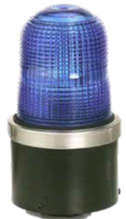
XEMIP-B (PICTURED) (XELED-B is the LED Version)