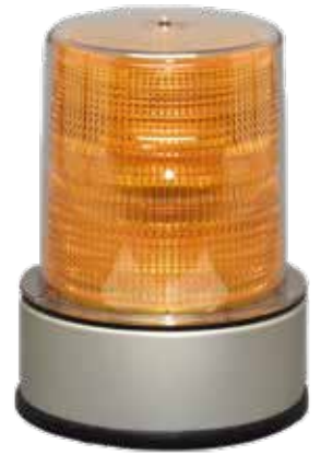
DFS850HSP-A or Q2500-A (ST-77 Bulb) Black Base