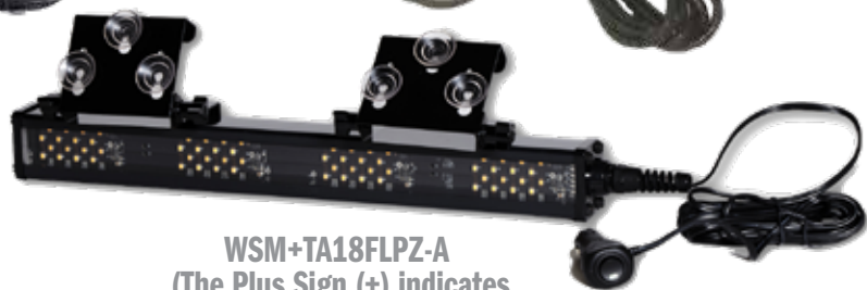
WSM+TA18FLPZ-A (The Plus Sign (+) indicates user select flash patterns)