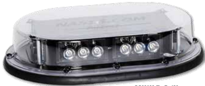
MINILP-C/X MINILPM-C/X (Mag Mt)