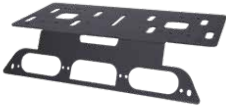
Part # VPEHD-F150