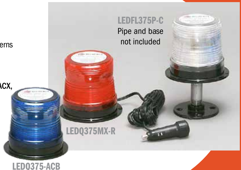
LEDFL375P-C Pipe and base not included