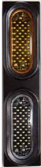
LEDQ045-A & LEDQ045-C in dual weld box WBE20

For OEM Installation in all work truck applications