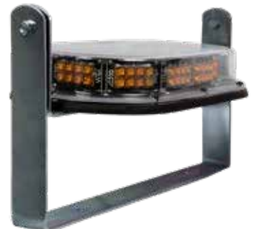
LB4 - with Mini Bar Installed (up to 18")