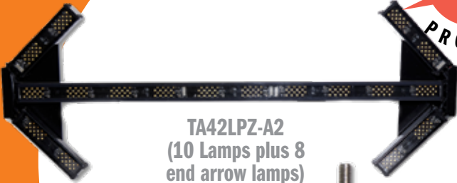
TA42LPZ-A2 (10 Lamps plus 8 end arrow lamps)