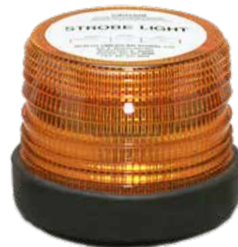
ST500-ACA (120V AC)

Ask us about the NEW LED500 Series PRODUCT