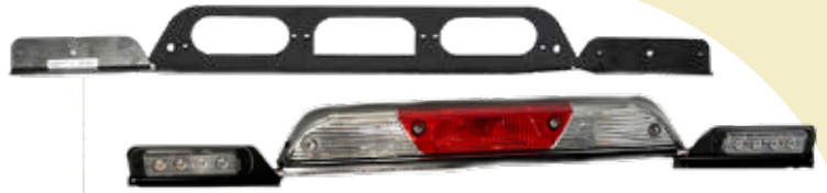
Part # VLEDHD-F150