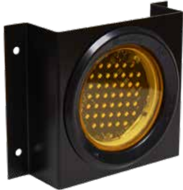
LEDQR45-A in MBR2