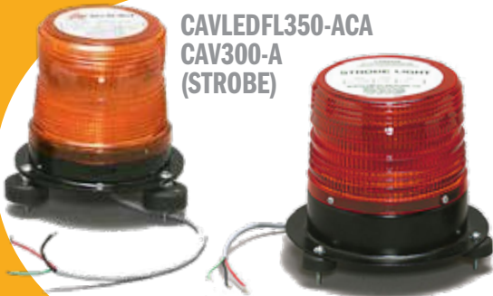
CAVLEDFL350-ACA CAV300-A (STROBE)