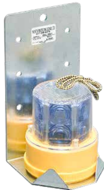
PSL-BKT Galvanized steel bkt. to hold PSL's