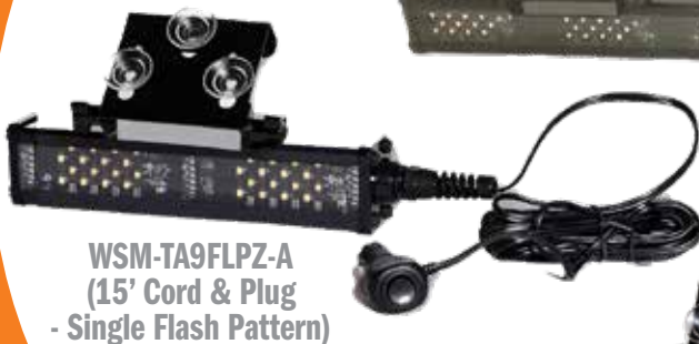
WSM-TA9FLPZ-A (15' Cord & Plug - Single Flash Pattern)