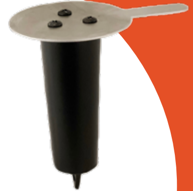
PS-HDL2 (Cone Handle)