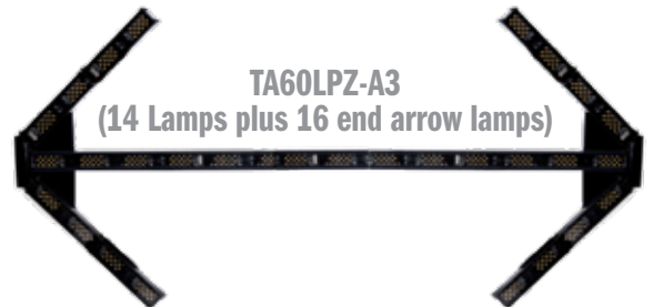
TA60LPZ-A3 (14 Lamps plus 16 end arrow lamps)