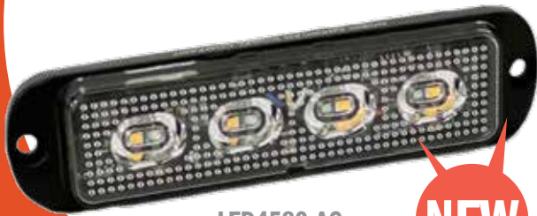
LED4580-AG (8 LED's)