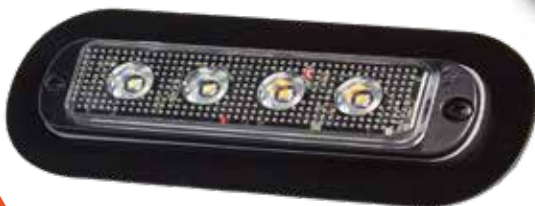
LED4400-B-PLATE (For Grill Mounting, Works on LED8800 too)