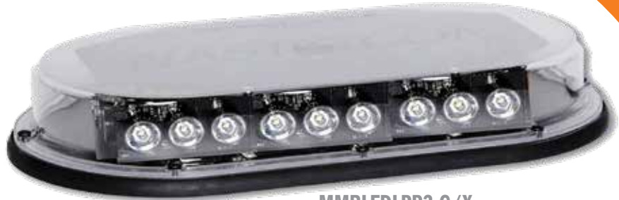
MMBLEDLPR3-C/X MMBLEDLPMR3-C/X (Mag Mt)