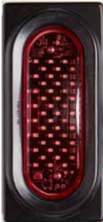
LEDQ0-R in a WBE10 Weld Box

Dual Color Split Unit to be used in States that allow two Color Flashing LED Lamps