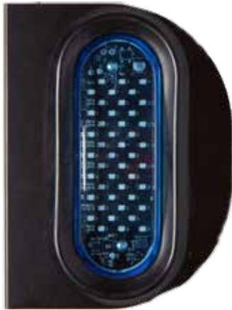
LEDQ0-B in a right angle bracket, MB01