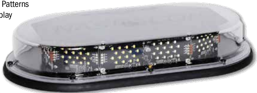
MMBZLEDFL-C/X MMBZLEDFLM-C/X (Mag Mt)