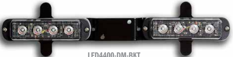
LED4400-DM-BKT (For mounting two units behind the grill)