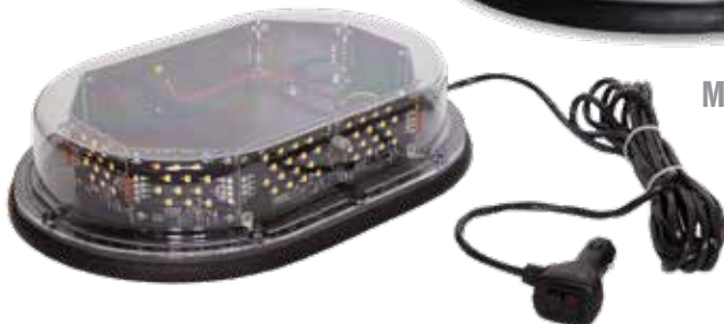
MINIFLZ-C/X MINIFLMZ-C/X (Mag Mt)