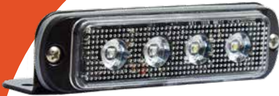
LED4400-L-BKT (For Mounting to a horizontal surface)