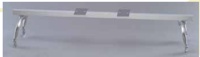
AB2 w/Rectangular Plates