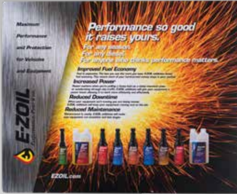
M117 COUNTER MAT