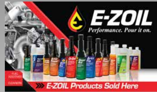
E-ZOIL Products Sold Here