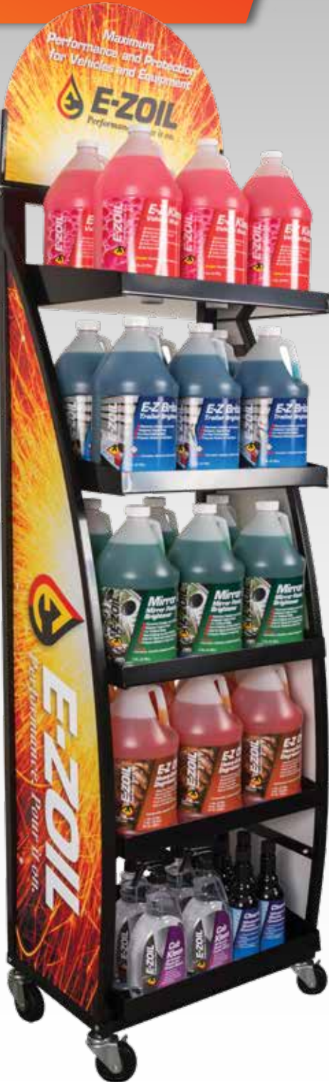
M110 FLOOR DISPLAY*