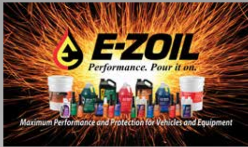
M121 HANGING BANNERS

To request marketing materials, contact your E-ZOIL sales representative today!