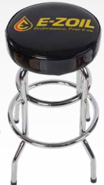
M118 COUNTER STOOL